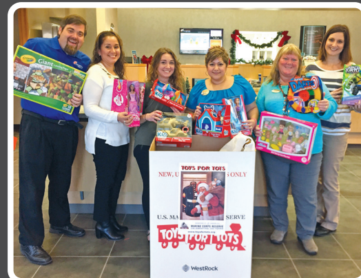
Toys for Tots drop off and fundraiser