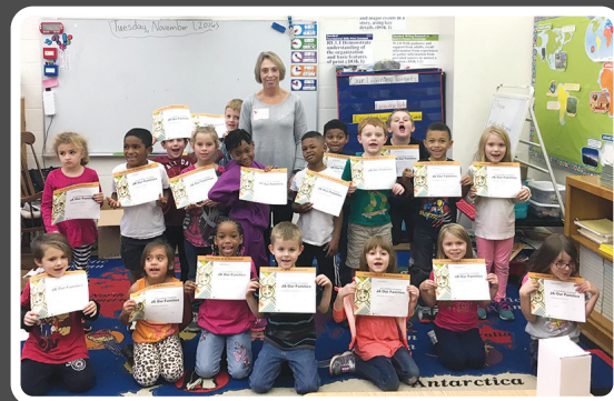
Ascentra employees volunteer and teach Junior Achievement in schools, making a positive impact in the lives of hundreds of students